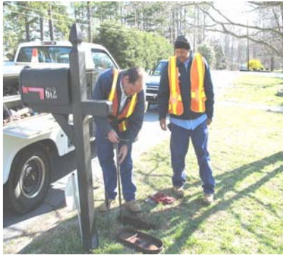
Maintaining water meters